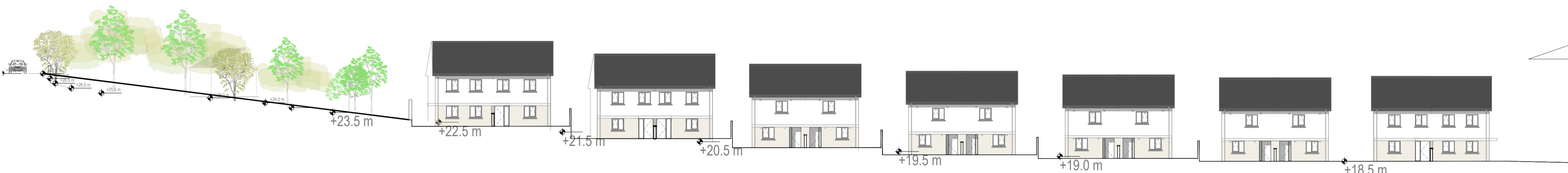
B-B ELEVATIONS - PART 1