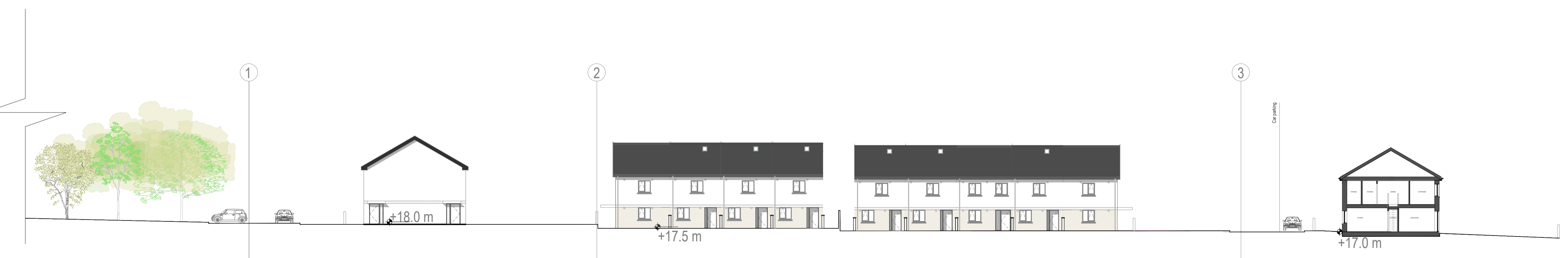
B-B ELEVATIONS - PART 2

GENERAL NOTES DO NOT SCALE. USE FIGURED DIMENSIONS ONLY. THIS DRAWING IS TO BE READ IN CONJUNCTION WITH ALL RELEVANT SPECIFICATIONS AND DRAWINGS. ALL DIMENSIONS TO BE CHECKED ON SITE. IN THE EVENT OF ANY DISCREPANCIES BETWEEN DRAWINGS, THE CONTRACTOR IS TO INFORM THE ARCHITECT IMMEDIATELY. NOTES: ORDNANCE SURVEY IRELAND LICENSE NO. AR 042116 © ORDNANCE SURVEY IRELAND AND GOVERNMENT OF IRELAND ORDNANCE SURVEY MAP SHEET NO. 3303-19 (3303-20) 3303-24 (3303-25) LEVELS BASED ON OS DATUM MALD HEAD